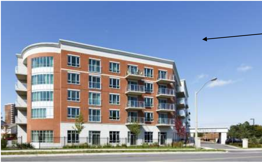
Figure 1. Wedgewood Retirement Home (Riverstone, 2014)

Web Image: Include a figure note describing the image and a parenthetical citation.